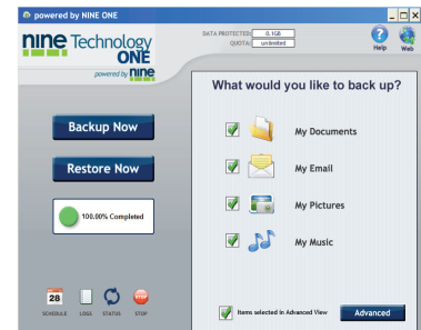
Simple, intuitive user interface with backup scheduler

Client software supported on: 32- or 64-bit XP, Vista, Windows 7 Memory: at least 128 MB Disk Space: at least 100 MB free Network Protocol: TCP/IP